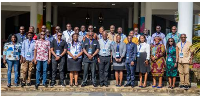
5th Annual Conference (Hybrid)