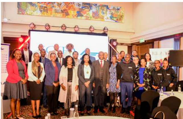
ICIFA 8th Annual General Meeting (Hybrid)