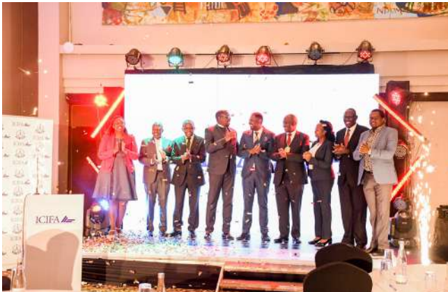
ICIFA College Launch