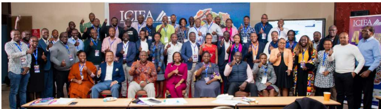
4th ICIFA International Investment Conference