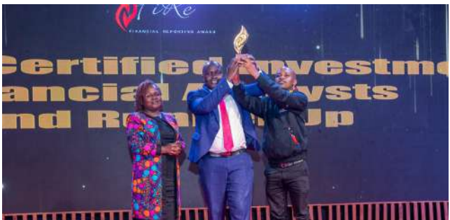
FiRe Awards 2023