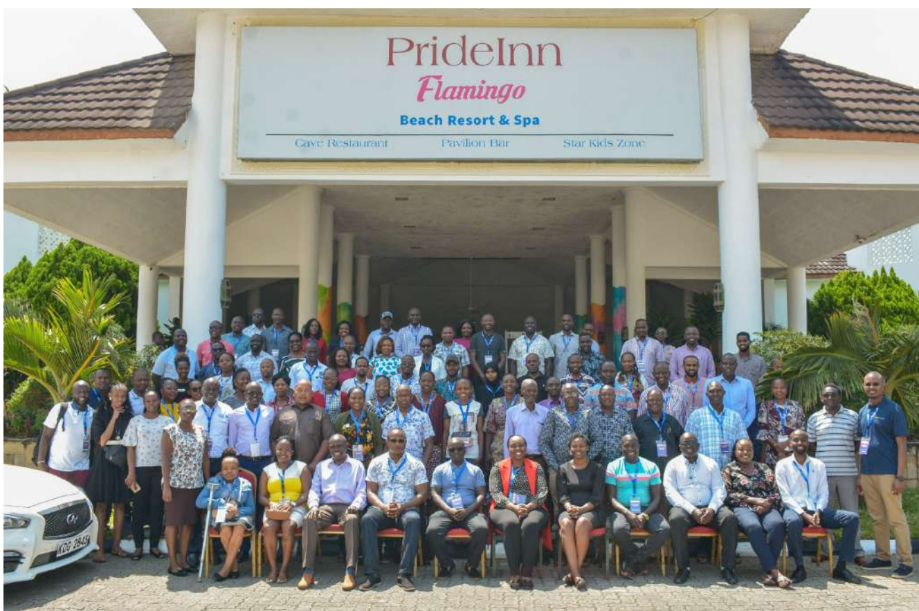
ICIFA-PSAB CFO Workshop