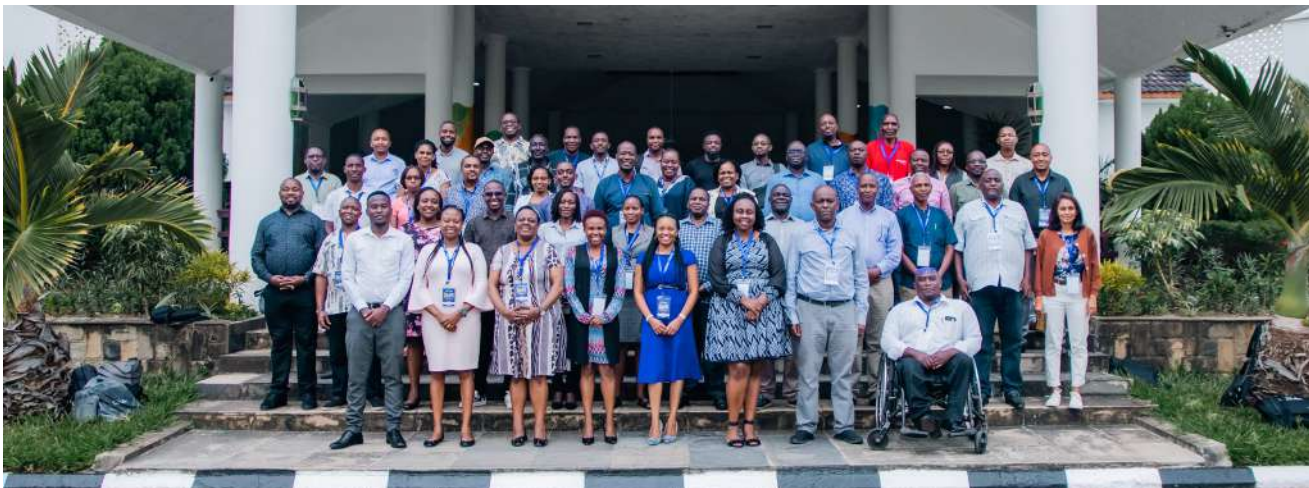
ICIFA 6th Annual Conference 2023