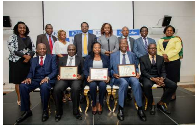
2nd Fellowship and Commendation Award Ceremony